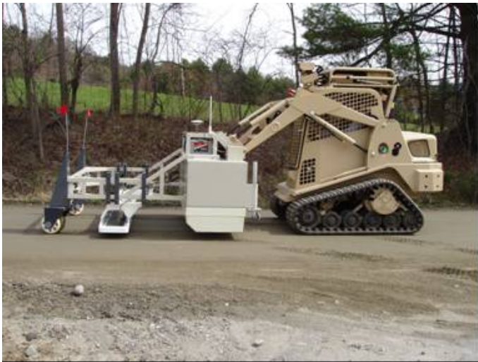
Figure 5. Detection Sensor Arrays Attached to Robotic Platform