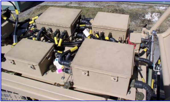
Figure 3. Platform Control Components (PCC) on Roof-Rack

We implement four cameras as part of the Nemesis robotic platform. Fixed wide-angle cameras are mounted on the front and rear of the platform for forward and reverse driving. Two additional cameras (visible zoom and infrared) are mounted on a pan/tilt unit. Feedback from the cameras is provided at the OCS video display, with options to display a single camera view or a split-screen with multiple views as noted in the previous section.