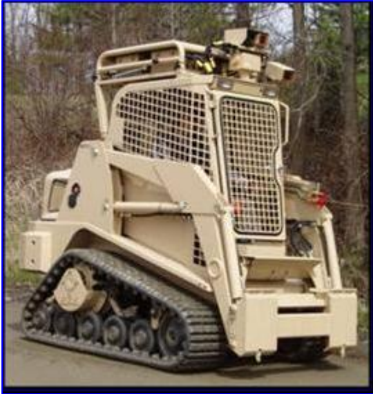
Figure 1. Nemesis HD Robotic Platform