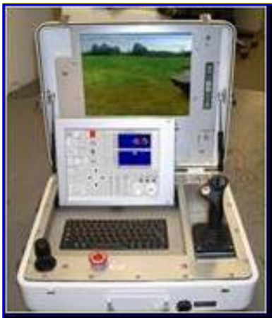
Figure 2. Operator Control Station (OCS)

Operation of the robotic platform is performed through control of the joysticks and functions on the touch-screen. Joysticks provide control of mobility and the