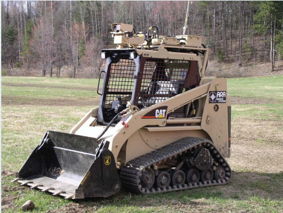
ARRA's Modular Robotic Control System installed on a Caterpillar 247B